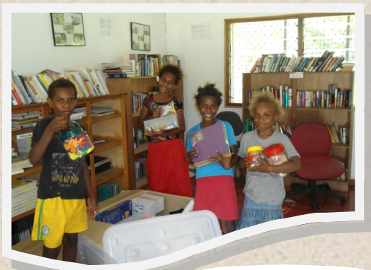
Ol studen blong Tautu Praemeri Skul oli smael wetem ol literasi mo numerasi risos blong olgeta

Kontak: Kurikulum Developmen Yunit—23508 In-seves Trening Yunit—23024