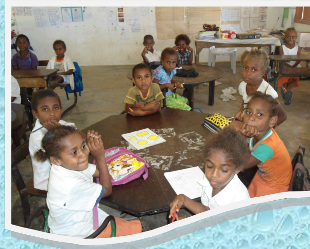
Ol Yia 1 studen blong Norsup Skul afta long 2014 en blong yia

Long yia 1 kasem yia 3 ol studen bae ol i lanem 4 sabjek: