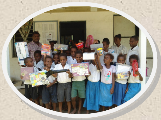
Ol studen blong Lakatoro Praemeri Skul wetem ol literasi mo numerasi risos blong olgeta

Yu harem mo save long ol riviou blong Nasonal Kurikulum blong Vanuatu?